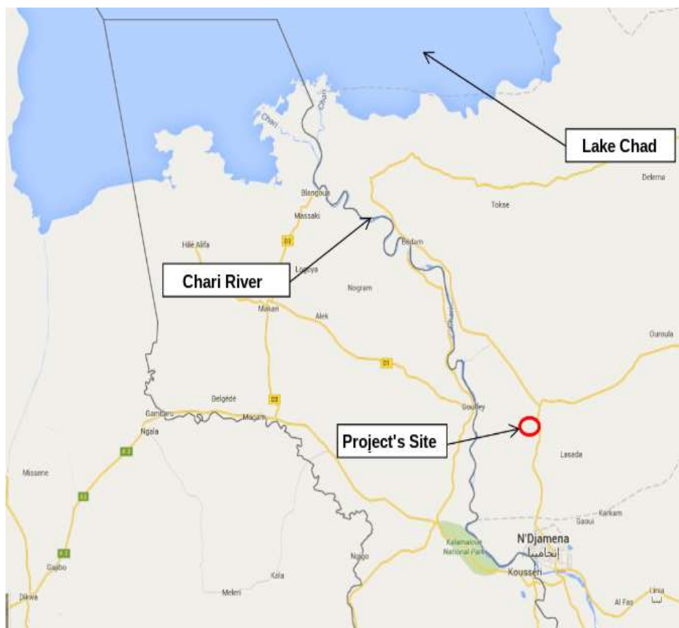
Figure 1: Project location

The site is located on a plain characterized by herbaceous vegetation that is abundant in rainy periods (from July to September) but which disappears the rest of the year. The Project site is relatively flat with a general slope running from northwest to southeast with a difference in elevation of about 3 metres. The elevation varies between 295.09 and 291.83 metres.